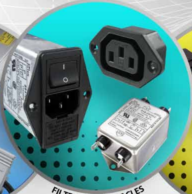
FILTERS & RECEPTACLES