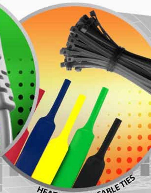
HEAT SHRINK & CABLE TIES