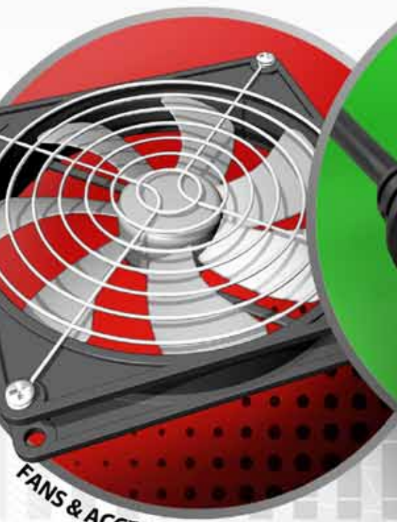
FANS & ACCESSORIES